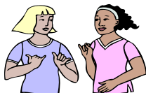
Talk to someone

Most problems can be resolved quickly if students speak with someone who knows how to help. You do NOT have to give your name.