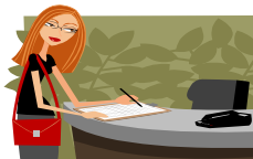
Fill in a complaints form

If the matter cannot be resolved by talking to someone a Complaints & Appeals form should be filled in and given to the Student Services Officer. There are no associated fees for this.